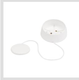
Surface mounting accessory for a GWA connected water sensor1514.