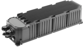
Smart [PRO] 3x2M Remote power unit