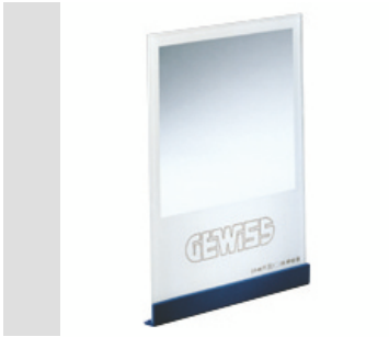
Anti-glare louvre for HORUS 3.