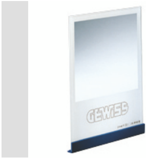
Anti-glare louvre for HORUS 3.