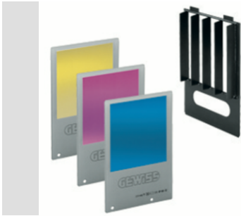
Anti-glare louvre for HORUS 1.