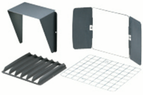
Anti-glare louvre for HORUS 2.