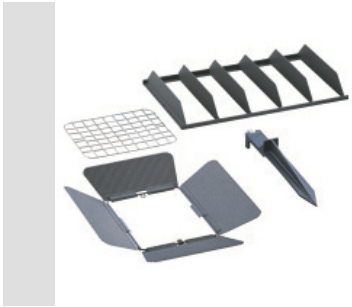
Barn door shutter in graphite grey painted steel.